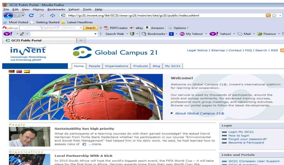
Figure 2: Global Campus 21 Portal

It should be noted that the tutors have their own site, called the Tutors’ Lounge, where coaching and interaction takes place. Tutors also upload their own reports and chat on this site.