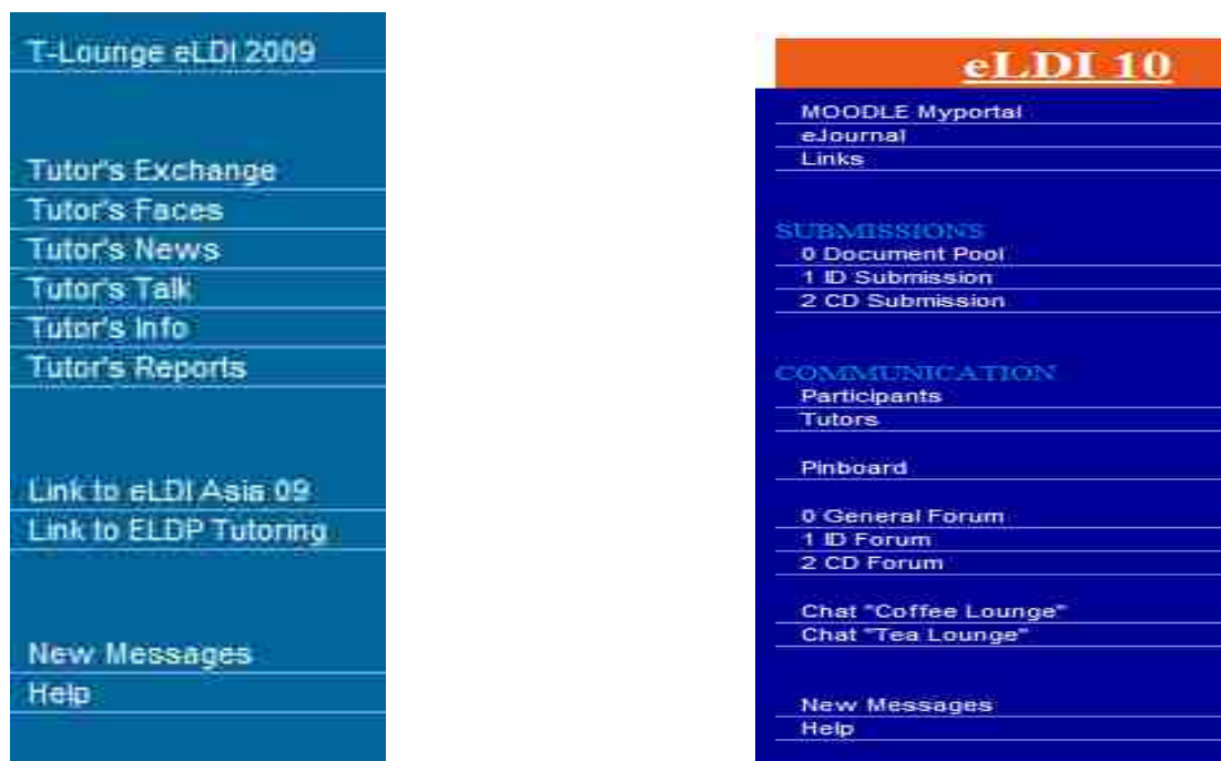
Figure 3: Communication Tools of Tutors and Participants

Monitoring and Evaluation. In order to monitor the performance of the learning community, a participant's track was designed for tutors to fill in the information on the activities of participants.