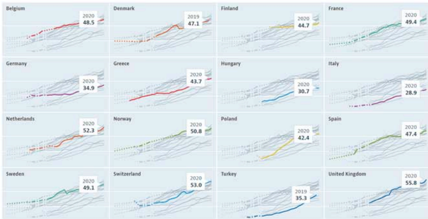
Fig. 2.1. Population with Tertiary Education, 25- to 34-Year-Olds (%), Selected Countries, 1987–2020.

a number of countries, such as Italy, Hungary, Germany and Turkey, however, even the 40% is not achieved. To a large extent, these are real differences; for another, smaller part, it has to do with definition differences. 1 Some countries, such as Poland and Turkey, show a relatively late but very fast growth, while a country like Finland already had a share of almost 40% tertiary educated people in this age group at the turn of the century, and this share has hardly risen in 20 years.