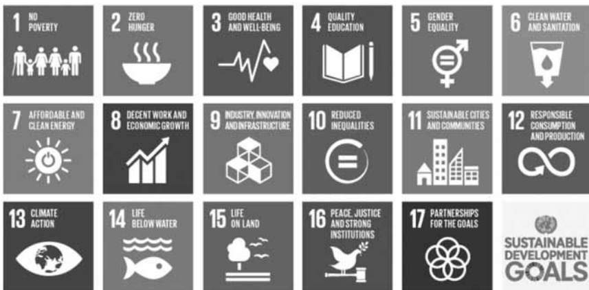
Fig. 8.1. The SDGs.

They extend from goals relating to the natural world and our interaction with it, for example Goal 13: Climate Action , Goal 14: Life Below Water and Goal 15: Life on Land , to those which focus predominantly on human systems, such as Goal 1: No Poverty or Goal 4: Quality Education . As such, the goals range across the human–nature continuum and should play a role in understanding and fostering socio-ecological resilience as outlined by Folke et al. (2016) above. The intention of the SDGs is to outline the processes through which human activity will become more sustainable, with fewer pressures on natural earth systems, with a desire to possibly even bolster their health and quality. The goals are intended to be used as overarching principles at country and authority levels, to allow politicians to understand the overall directions of change they have agreed to follow in ameliorating the present crisis position we find ourselves in. Some sectors have