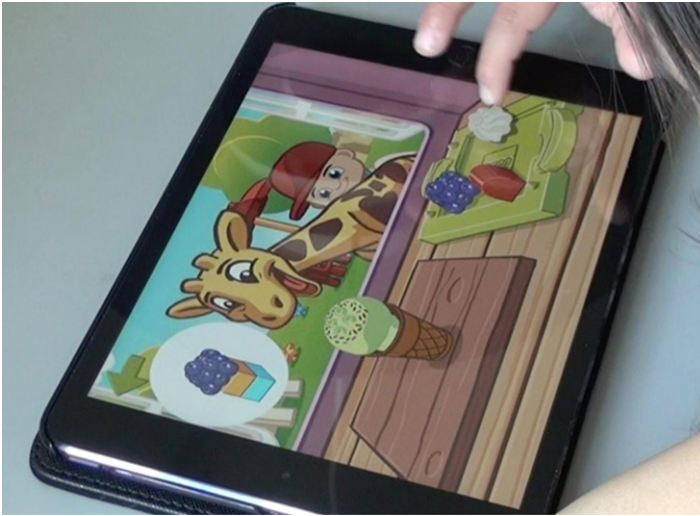
Figure 5.2. Making Ice Cream for People. In This Case a Giraffe, and the Child Creates an Ice Cream based on Own Taste (Not the One Requested by the Giraffe).

cream requested by this character when playing the LEGO food app; or by acknowledging their role in the game by saying ‘we have to make ice cream for people’ (see Figure 5.2). This role is dictated by the app design, and children participate in this role-play setting by being ‘there’ in the narrative, but not losing sight of the ‘here’, being aware of their peers in the room. Such an appropriation aspect aligns with other appropriation definitions. For example, when examining the topics of space and place in the context of technology experiences, Dourish (2006) discusses the role of appropriation and proposes: