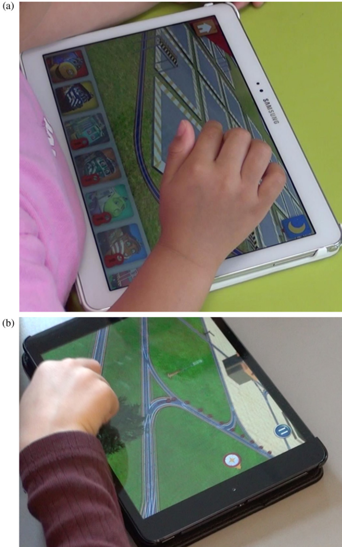
Figure 5.5. (a) and (b) Playing with the Map (Not the Character) in an App.