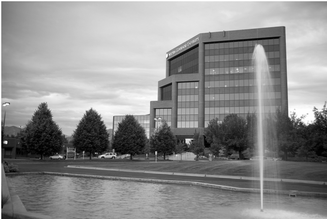
A national online institution, WGU's administrative offices are in Salt Lake City, Utah.

Perhaps the most significant of the early grants received by WGU came from the U.S. Department of Education. Besides USDOE's award of a $10 million Star Schools grant to build out the curricular programs of WGU's Teachers College for high needs teaching areas identified in the "No Child Left Behind" legislation, the USDOE offered an important scholarship grant. WGU applied for and was awarded a $3.7 million "Transition to Teaching" grant that enabled highly qualified paraprofessionals in the university's partnering school districts (Clark County, Nevada, Region IV of Houston, Texas, and later El