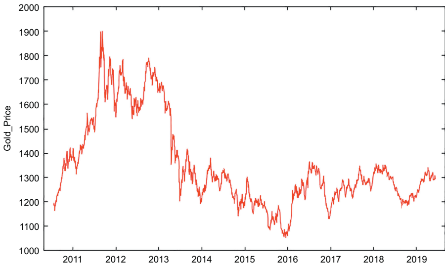
Figure 3. Gold price for the period 19 July 2010–11 April 2019