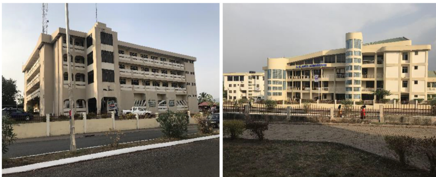
Figure 1. View of Ho Technical University (HTU campus)

This study was carried out at Ho Technical University (HTU). HTU, as displayed in Figure 1 was established in 1968 as a technical institute with the primary objective of providing pre-technical education but has over the years evolved into a polytechnic (1986) and currently a technical university (2016). The institution is mandated to award degrees to the highest level including diplomas, certificates and other qualifications in engineering, science and technology-based disciplines, technical and vocational education and training, applied arts