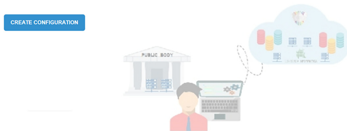
Figure 3. Start page for the storage project-specific configurations

Here you can create Global Settings for all Archiving Projects within your Organization.