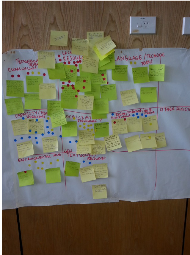
Plate 2. Clusters of prioritised issues and solutions from focus groups

validity and relevance for gauging community perceptions of the environment on small islands is demonstrated by Green (2005) . In this case, the participants were divided into small groups and given a stack of images that visually represented various aspects or elements of what could be perceived as climate change (for example, an image of a cyclone). These included a description written on the back, and additional blank cards could be drawn or written on by participants and added. The participants then placed the images on a grid along a continuum according to agreement with a statement, such as “I teach my students about this climate change issue” (teachers only) ( Plate 3 ). This was then discussed as a group and transcribed, as well as photographed. This was used to generate discussion, and not to produce quantitative data, as sometimes is the case in Q-sort applications.