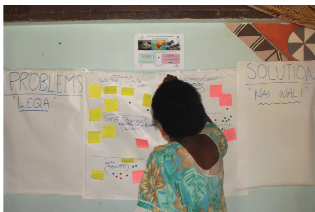
Plate 1. Problems and solutions identification exercise

3.2.1.2 Activity 2: Q-sort. Q-sort is a collective image sorting method of agreement with a statement, which is then used to prompt discussion (Palmer, 1983; Pitt and Sube, 1979). “Q-methods” were designed to be an objective method for the study of subjective values, opinions and meanings, in conjunction with other methods (Robbins and Krueger, 2000). Its