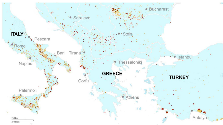
Figure 2. Some of the European sites affected by forest fires in 2021