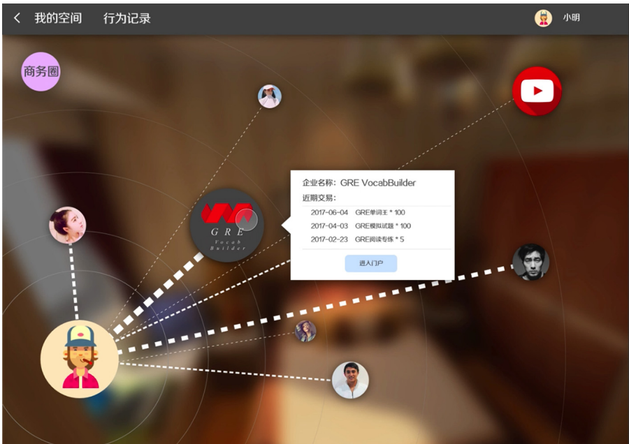
Figure 4. Space information page (individual)