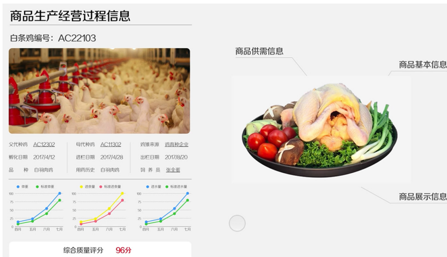
Figure 6. Production process information page (commodity)