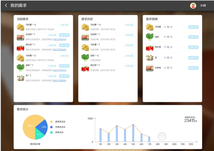
Figure 3. Supply information page (individual)