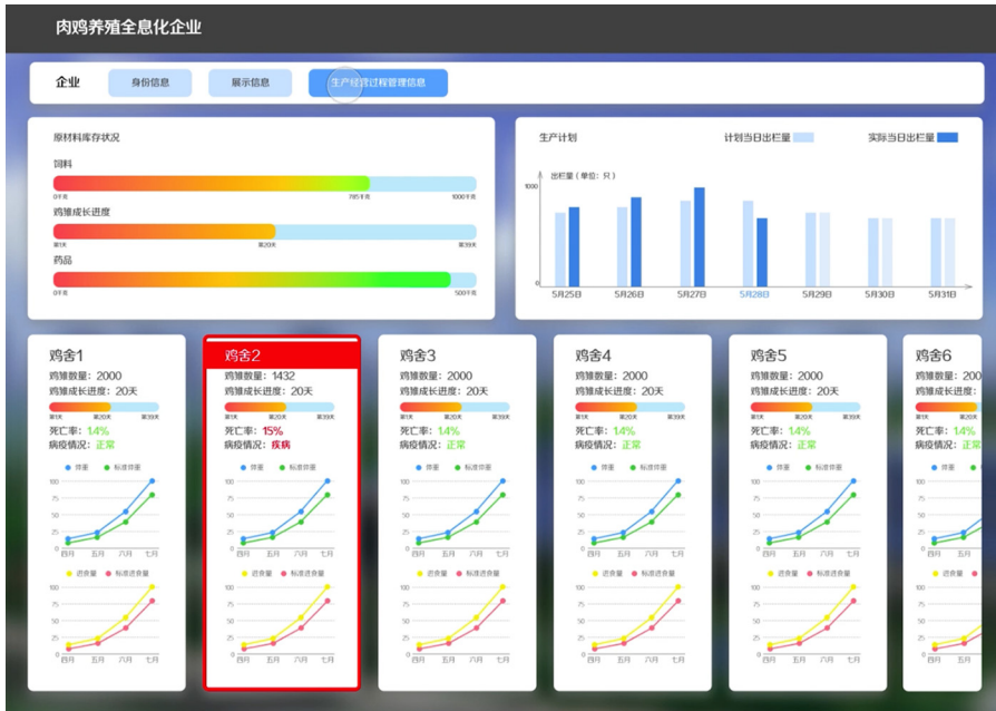
Figure 5. Production process management page (enterprise)