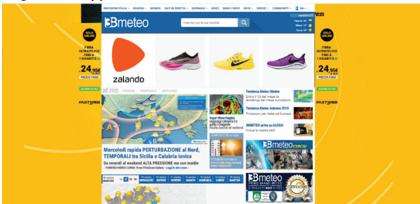
Figure 2. Visual stimulus

Imagine then to leave the site without finalize the purchase. Imagine that the day after, browsing the web, you open the website of 3BMETEO.COM, finding yourself in front of an announcement advertising that shows the exact products that you have displayed during the navigation of the day previous.”