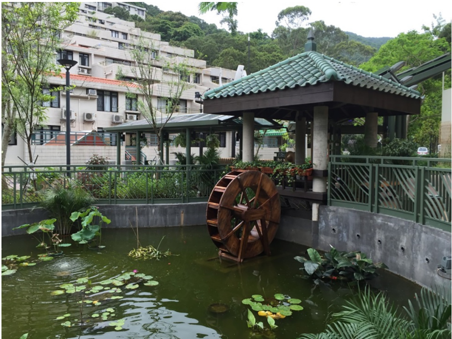
Plate 1. The Chinese-style design of the eco-garden