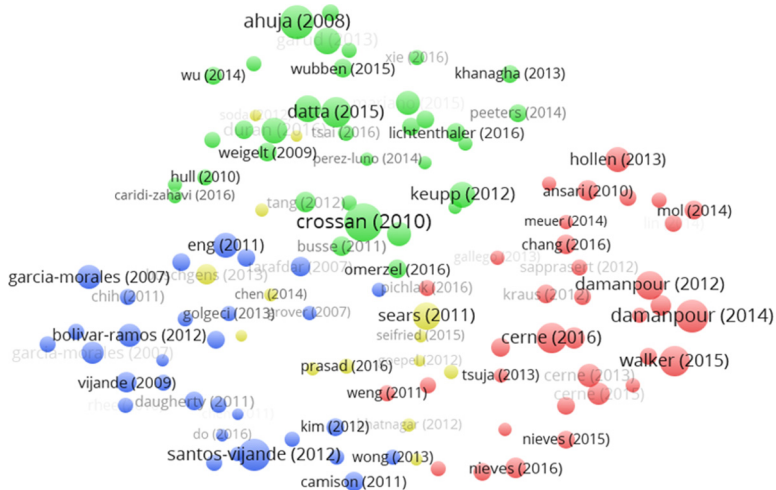
Figure 2. Bibliographic coupling cluster network