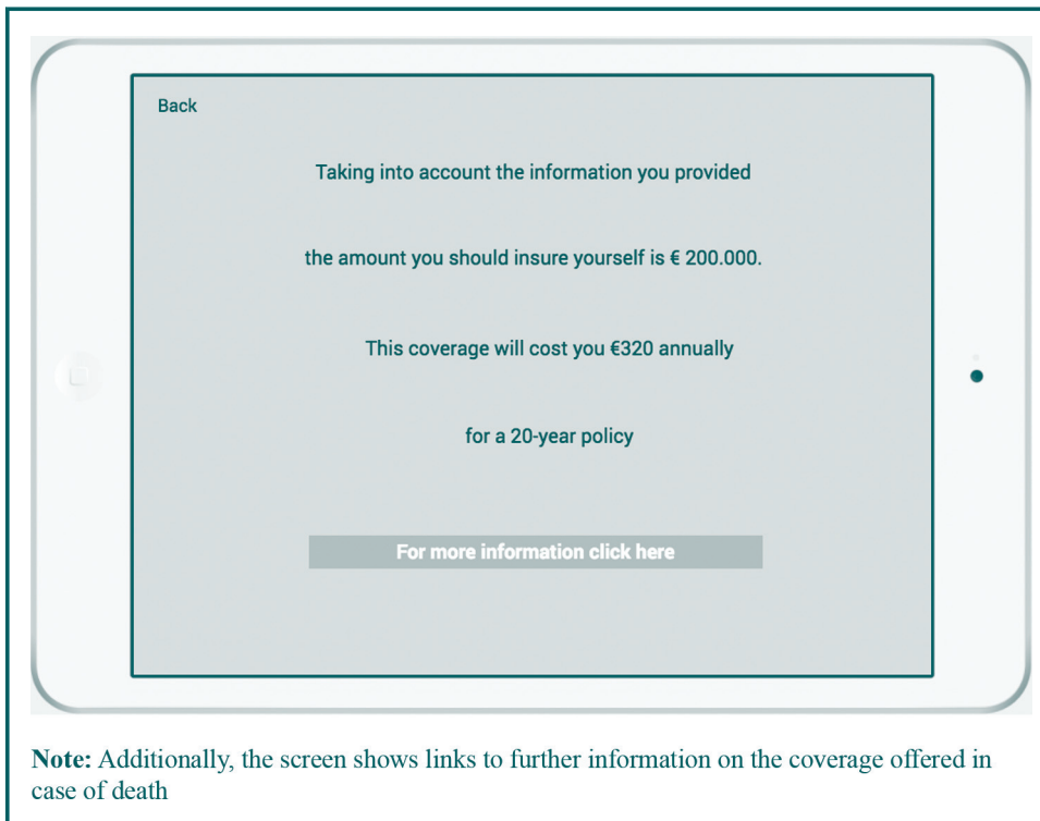
Figure 3 In this screen, the user is shown the ideal amount of insurance, as well as the yearly fee for the coverage amount

To respond to the growing number of requests for insuring cyber risks by businesses, the company decided to enrich the portfolio of products it sells and offer insurance policies for cyber risks. The author studied insurance policies offered to businesses and several types of policies were found adequate. The following products were added to the portfolio: