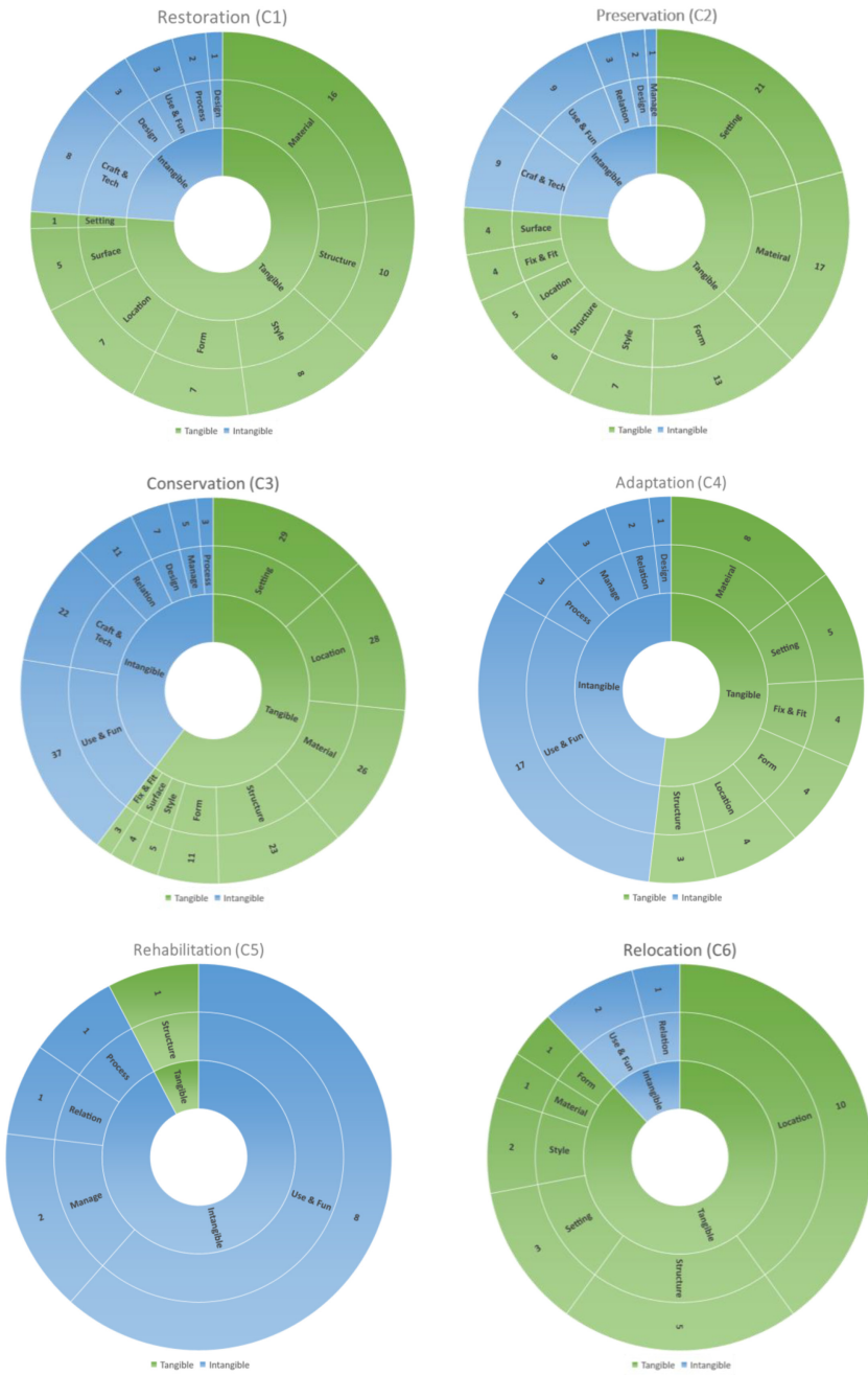
Figure 2. The eight intervention concepts and their proportional references to the fourteen subcategories (tangible and intangible attributes)