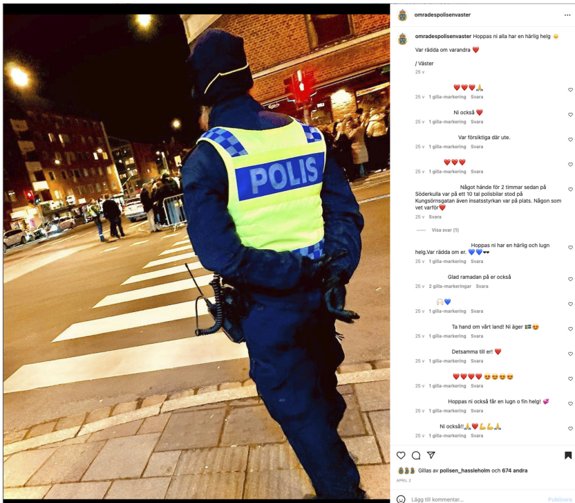
Figure 1. We hope you all are having a good weekend