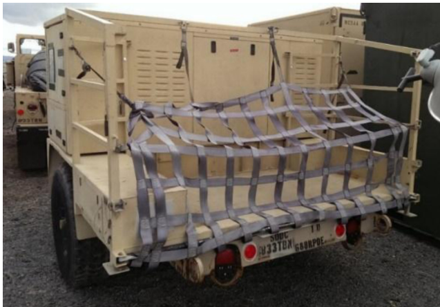
Plate 3. Empty vehicle bay with adjustable netting

pallet's content listing, then it would be difficult to determine if the pallet can be broken down or if it must remain intact as one solid piece of cargo.