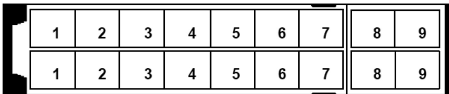
Figure 2. C-17A in and LGS configuration with 18 463L pallet positions