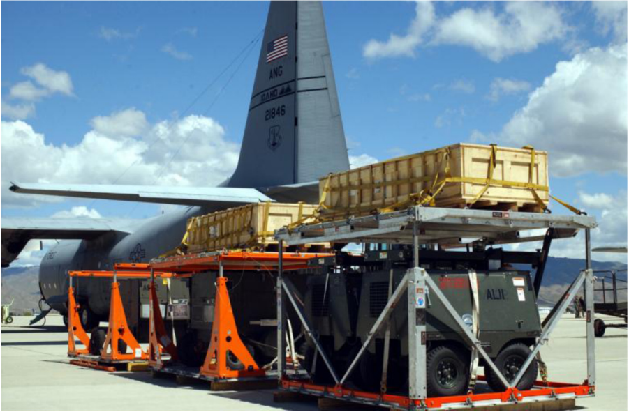
Plate 2. 4 PPs consolidated to 2 PPs using BALS