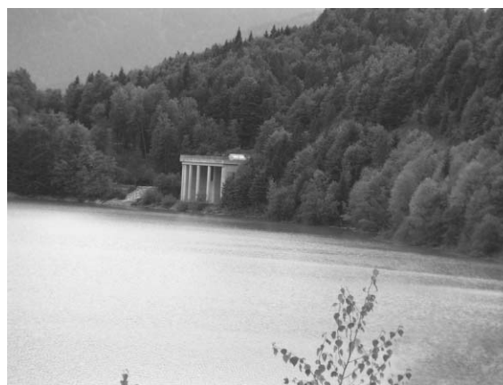
Fig. 4. Sylvenstein overflow structure known as the Sylvenstein Temple