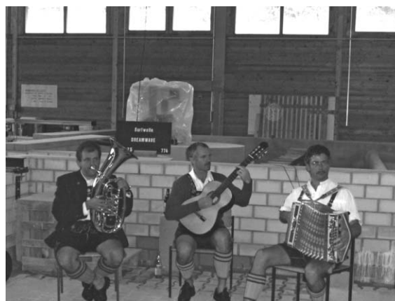
Fig. 2. Delegates were entertained during lunch

Walchensee Lake water passes via an intake structure at Urfield through a 1.2 km long tunnel to a 10 000 m 3 capacity balancing tank situated within higher ground about 200 m above the turbine hall. Water is fed to the turbines through six 2 m diameter, 450 m long pipes. A funicular railway is used to transport staff and visitors alongside the steeply sloping feed pipes to the balancing tank building. There is a large visitor and exhibition centre at the plant which is visited by nearly 100 000 visitors annually.