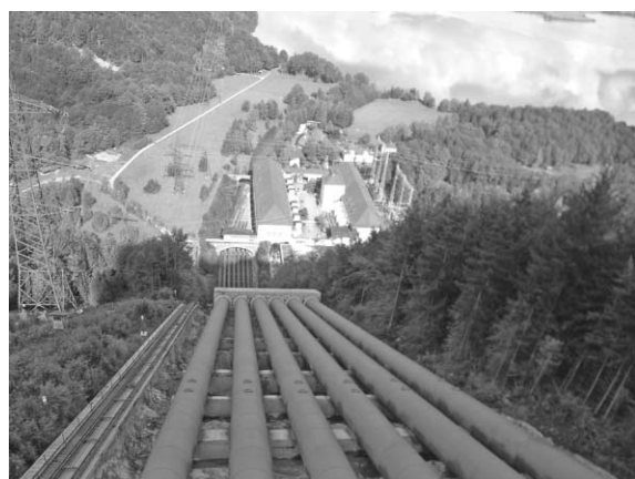
Fig. 1. Walchensee hydropower station

Walchensee hydropower station is one of Germany's largest hydropower plants with a maximum rating of 124 MW and an average annual output of 320 million kWh (see Fig. 1). At full capacity, the four Francis turbines and four open jet Pelton turbines require a water flow of some 84 m 3 /s.