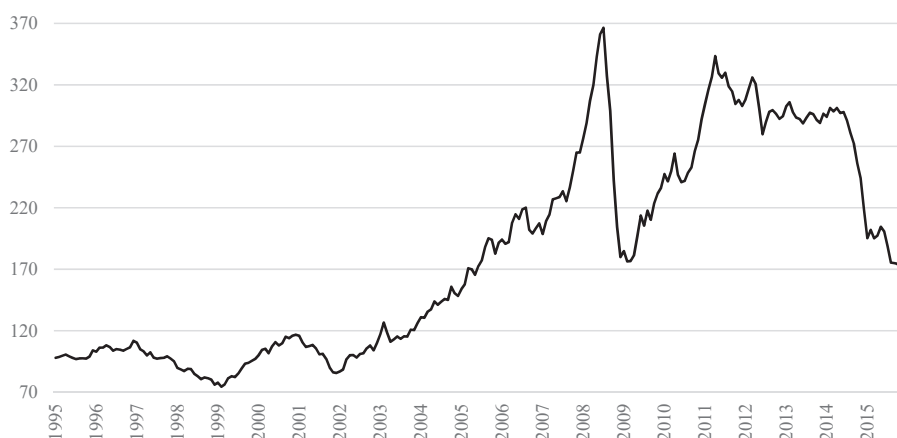
Figure 1. Evolution of commodity prices, 1995–2015* (Index base 100 in 2000)