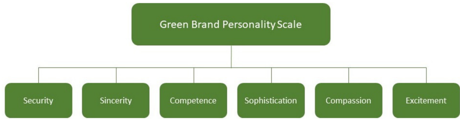
Figure 2. BPS adaptation for green brand personality