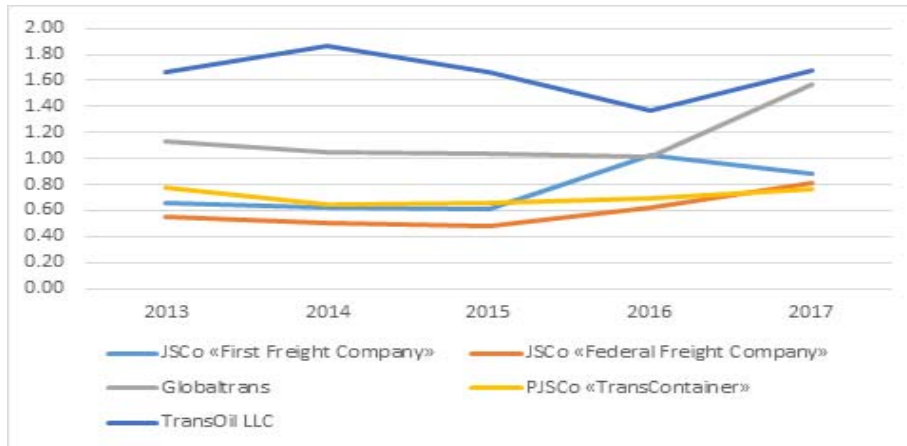
Figure 2. Dynamic of financial efficiency.