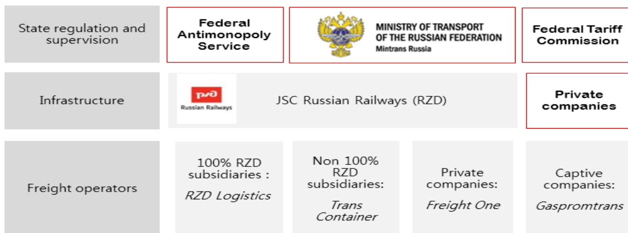
Figure 1. Structure of Russian Railway freight market.

The structure of the railway industry in Russia today is the infrastructure of public railway transport (road, track facilities, railway stations, etc.) is almost entirely owned by Joint-Stock Company (JSC) Russian Railways, which is providing infrastructure services as "natural monopoly". The majority of the country’s rail infrastructure network and the locomotive fleets are owned by JSC Russian Railways (RZD), a state-owned-enterprise, operating freight and passenger railway services (JSC RZD 2014). Regulation of competition and innovations it the railway sector in Russia takes place mainly on the governmental level. Figure 1 shows the structure of Russian railway freight market nowadays. The Federal Law on Railway Transport in Russian Federation of 19 May 2003 provides a legal basis for the organization of the sector and the legal relationships between the owners of railway assets, shippers and State authorities. Conceptually it divides rail transport between