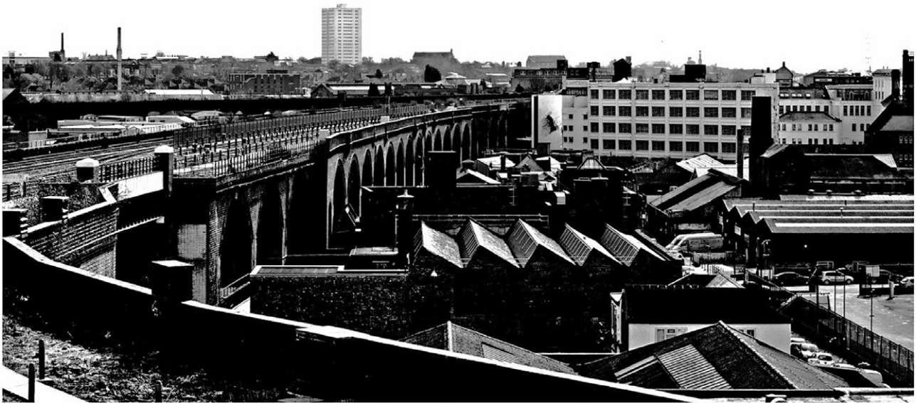
Figure 2. Views of Digbeth c.2000