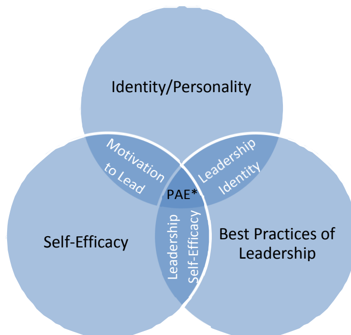
FIGURE 4. Proposed Practitioners' Model for High School Student Leadership Development *PAE = Personal Application Experiences