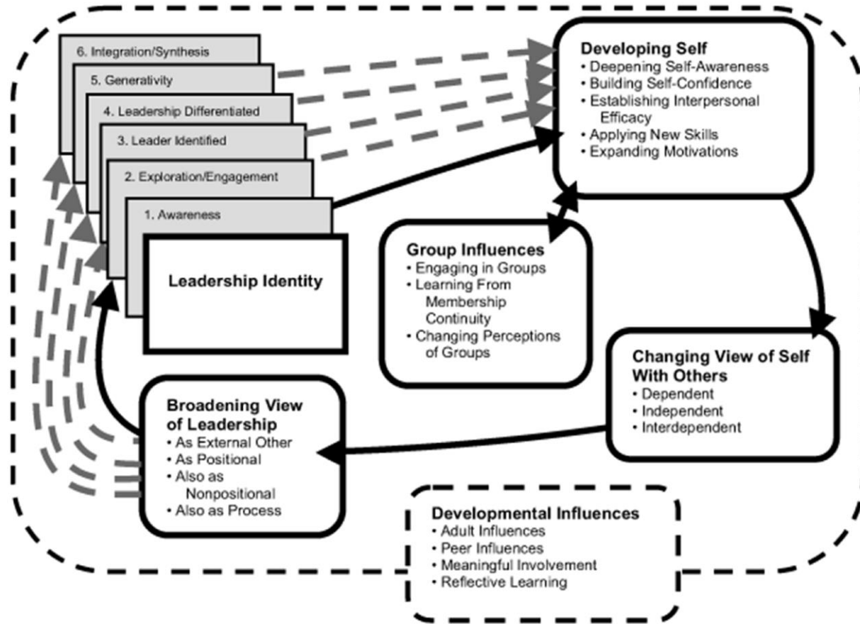
FIGURE 3. Developing a Leadership Identity: Illustrating the Cycle (Komives et al., 2005, p. 599)