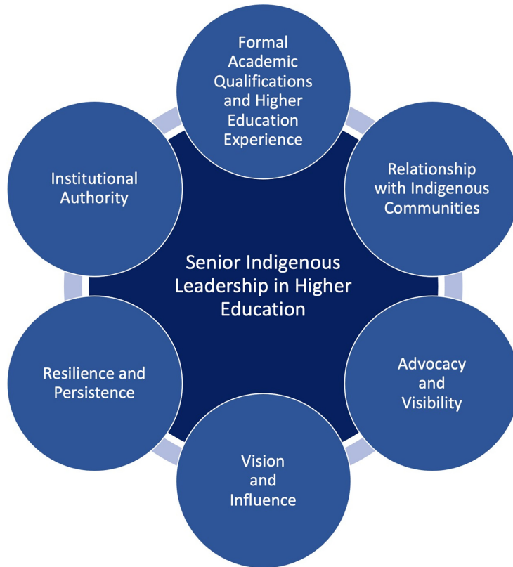
Figure 2. Essential components of senior Indigenous leadership in Australian higher education from the perspectives of Indigenous academics