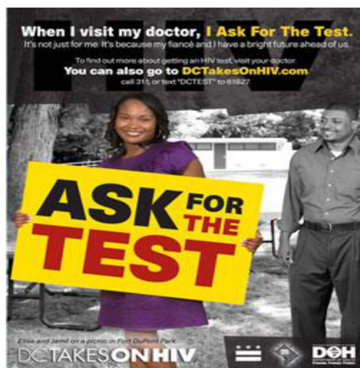
Figure 2. Awareness Raising Campaigns from “The Bronx Knows” and DC DOH (prior to HPTN 065)

of newly reported HIV cases was higher than in other comparable US cities (136.4 per 100,000 people) based on critical investigative report by a watchdog organization called DC Appleseed (DC HIV/AIDS Epidemiology Annual Report, 2007; Greenberg et al. , 2009). The DC Mayor declared HIV to be his top public health priority. In June 2006, the DC DOH launched a citywide rapid HIV screening campaign called “Come Together DC—Get Screened for HIV” (Castel et al. , 2012). The community was involved at the outset including government leaders, clinics and hospitals, faith-based leaders and multiple other stakeholders (Martin, 2010). City officials called stakeholders in for a meeting with physicians. In addition to local philanthropists, the city involved the corporate sector. The campaign had three goals: