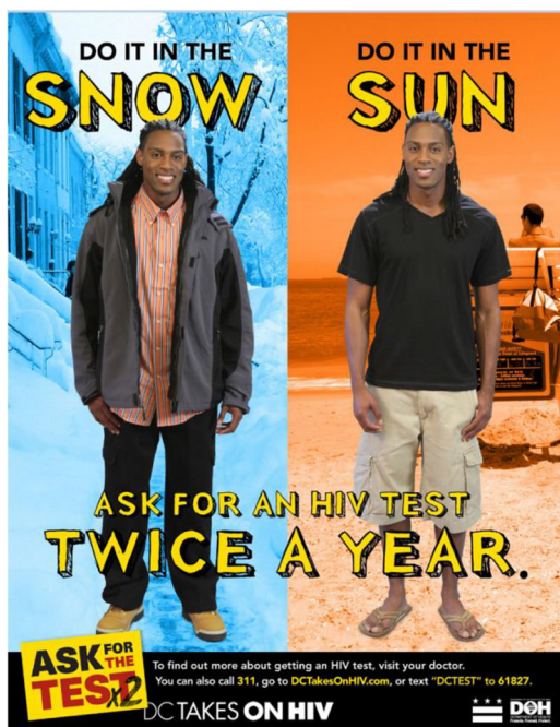
Figure 3. Awareness Raising Campaigns for MSM during HPTN 065 in Bronx, NY and Washington, DC