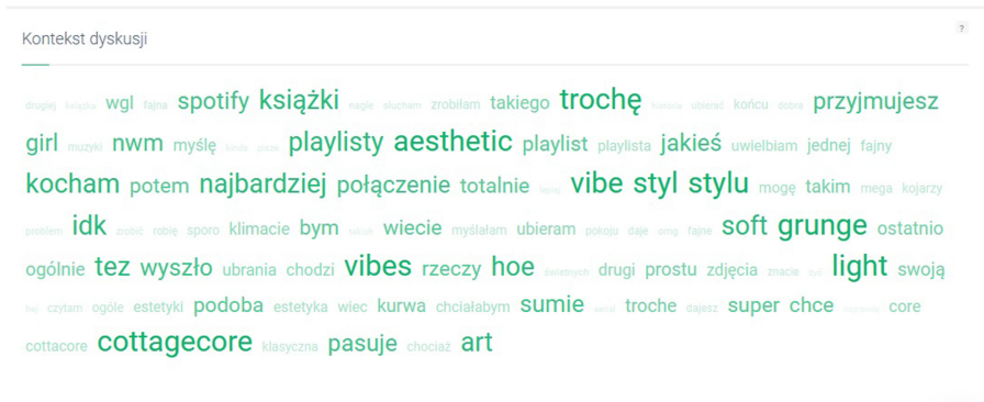
Figure 2. Keywords related to the term “dark academia”