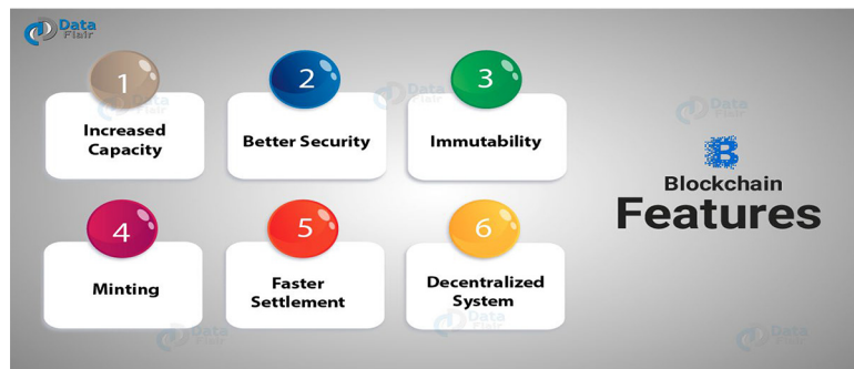
Figure 2. Characteristics of blockchain technologies