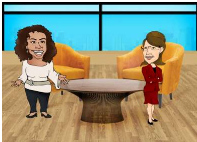
Figure 3: Sample student visual ( Puppet Pals ).

The usual ending of this stage, once all of the groups have finished their videos, sees the class watching all of the dialogues together on the class projector. This can be the first time for the students to see the different vocabulary that the other groups selected and apart from the enjoyment gained from the students of having their work displayed, allows the vocabulary to be shared in a contextualized, personalized and memorable way.