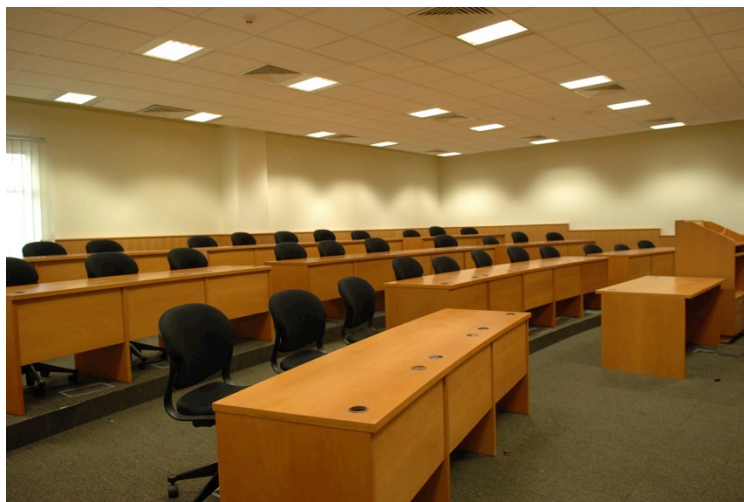
Figure 5: Auditorium type classroom.