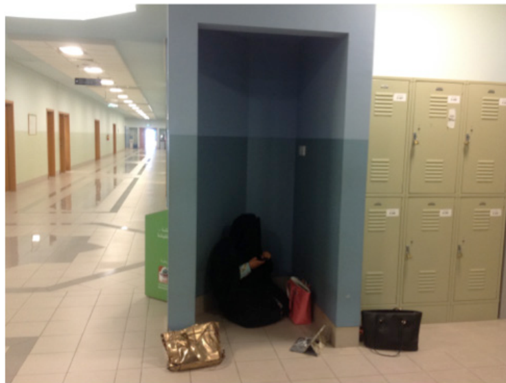
Figure 2: Student in an alcove.

Education and space (physical environment) are two separate domains that have always been addressed separately in the literature. Although a shift towards spatial inclusion in education has begun, with recent educational theory following social theory in what is being called the 'spatial turn' (Gulson & Symes, 2007a, 2007b; Ferrare & Apple, 2010; Taylor, 2009; Thrift, 2006), the link between physical environment and pedagogy is still ambiguous and embryonic (Ferrare & Apple, 2010; Gulson & Symes, 2007a, 2007b; OWP/P Architects et al., 2010; Gruenewald, 2003; Taylor, 2009; Temple, 2008). There are very few studies that link space to women's education (Tamboukou, 2003; Quinn, 2003), and no studies