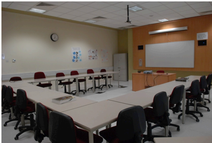
Figure 4: U-shaped classroom arrangement.

This technique revealed aspects of their conceived and lived space when they communicated their feelings and perceptions of the space and its influence on their learning experiences. However, I only resorted to it when I felt that the interviewee needed a trigger or a reminder of a specific space.