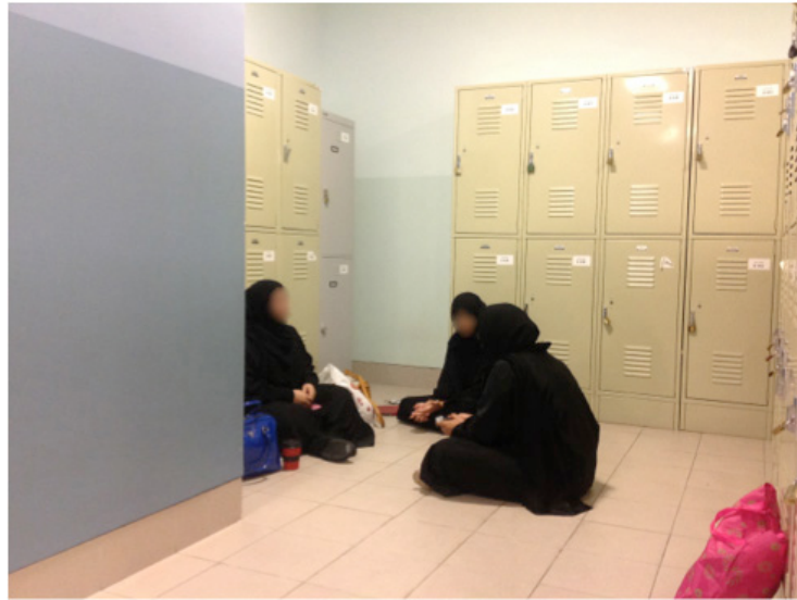
Figure 1: Students behind lockers.

space in a single-gender learning context. This was an interdisciplinary study conducted in Fall 2012 and Spring 2013, investigating the intersection between the domains of women, education and space.