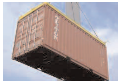
Figure 3. Ship Container

Ship Capacity. A ship's capacity is measured by several formulas. Dead weight tonnage (DWT) is the total weight of cargo, supplies, and crew that can be loaded on an "empty" ship. Gross register tonnage (GRT) measures the total internal capacity of a vessel. One GRT is equal to a volume of 100 cubic feet. The average tanker is between 250,000 and 350,000 DWT; dry bulk carriers average 100,000 to 150,000. Twenty-foot equivalent units (TEUs) 2 refer to a container-ship's total cargo-carrying capacity (see Figure 3). The average containership has a capacity of about 5,000 TEUs and can carry around 3,000 40-foot containers.