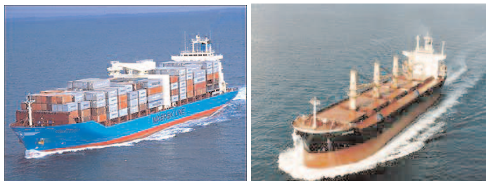
Figure 1. Containership (l) and Bulk Carrier (r)

Currently, there are about 26,300 merchant ships trading internationally, transporting every kind of cargo (see Figure 2 and Table 1). As of January 1, 2008, the world trading fleet was made up of 50,525 ships, with a combined tonnage of 728,225,000 gross tons.