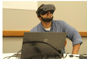
Plate 1. Participants in EVR and SVR conditions