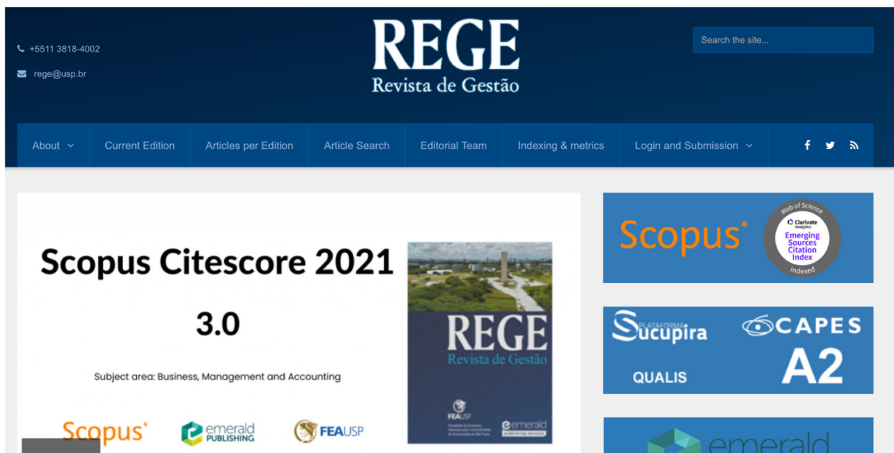
Figure 2. REGE website with a new visual identity

The challenges for REGE’s future are numerous, not only in terms of consolidating its current editorial practices but also in considering its role in important emerging discussions for the field of scientific publishing in business management, such as open science and the use of artificial intelligence in scientific publishing. We hope that this incredible journey, from a local journal to one of the highest-cited journals in the field of management in Latin America, is just the beginning.