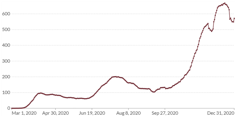
Figure 1. Daily confirmed COVID-19 cases in the US per million people, January 2020– December 2020*

Note(s): *The chart shows 7-day rolling average