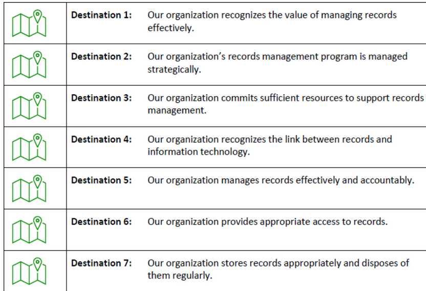
Figure 4. World Bank Group RMR – goals or destinations