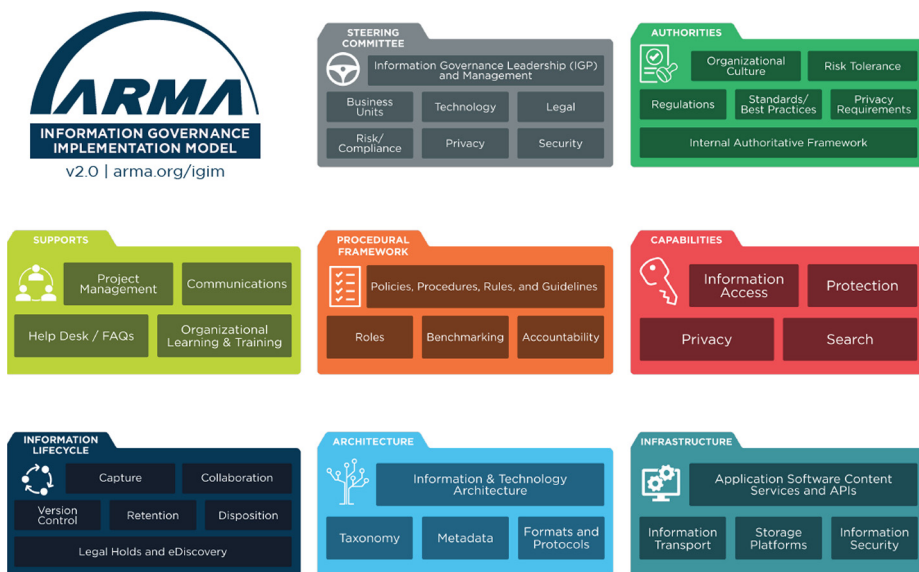
Figure 3. ARMA's Information Governance Implementation Index (IGIM) domain and components