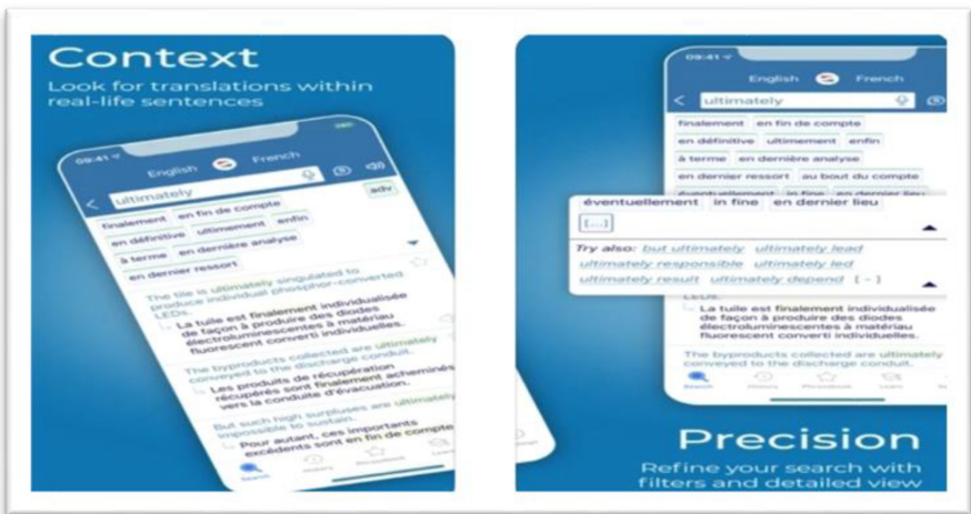
Figure 1. The interface of Reverso App

The mobile translation application used in the study was Reverso [1] (see Figure 1). It is a multi-platform mobile application developed for translation and language learning. It was founded in France by Theo Hoffenberg from Reverso Technologies Inc. The application supports more than 15 languages, including English, Arabic, Dutch, French, German, Hebrew, Italian, Japanese and Polish. Reverso is based on corpus data gathered from millions of authentic texts, including official documents, movie subtitles, product descriptions, etc. in multiple languages. Big data algorithms and machine learning approaches are used to process these texts to provide the user with accurate translation. The application includes several features such as online dictionaries in different fields, contextual translation, spell checkers and conjugation tools. The app received 4.6 out of 5 and was ranked #14 in the reference category in the App Store in Saudi Arabia with more than 10 million downloads [2].